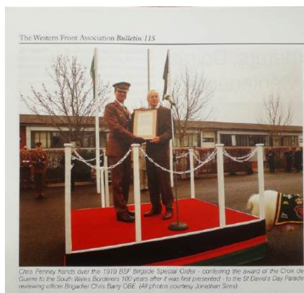
2019 St David's Day Parade.

I was able to inform the society on the issuing of 67th Infantry Brigade Special Order, dated 3 March 1919, quoting GOC General Louis d'Espèrey's Croix de Guerre Order to the South Wales Borderers: "In spite of heavy losses it pressed on...and thereby gave proof of its tenacity and offensively spirit, and formed an example of self-sacrifice of the highest praise." This brought a very personal journey full circle as I had previously handed over the fragile and significant March 1919 document to the Royal Welsh at Tidworth in 2019 during a St David's Day parade marking the 100th Anniversary of the Croix de Guerre presentation.