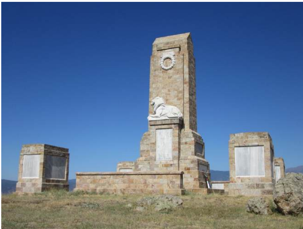
BSF Doiran Memorial to the Missing overlooking Lake Doiran.

No visit to the region is complete without viewing the hugely impressive CWGC Doiran Memorial. Designed by Sir Robert Lorimer, it features four square piers, each bearing name panels, placed to form a square around a 40 feet high central pillar carved with lions and stone wreaths. The lions wear different expressions; an angry lion facing former Bulgarian positions and a sad lion overlooking the Allied rear. Largely paid for by subscription from the officers and men who served on campaign, it commemorates the 1917-18 First and Second Battles of Doiran and remembers the more than 2,150 BSF members who fell in three years of fighting on the Salonika front and have no known grave.