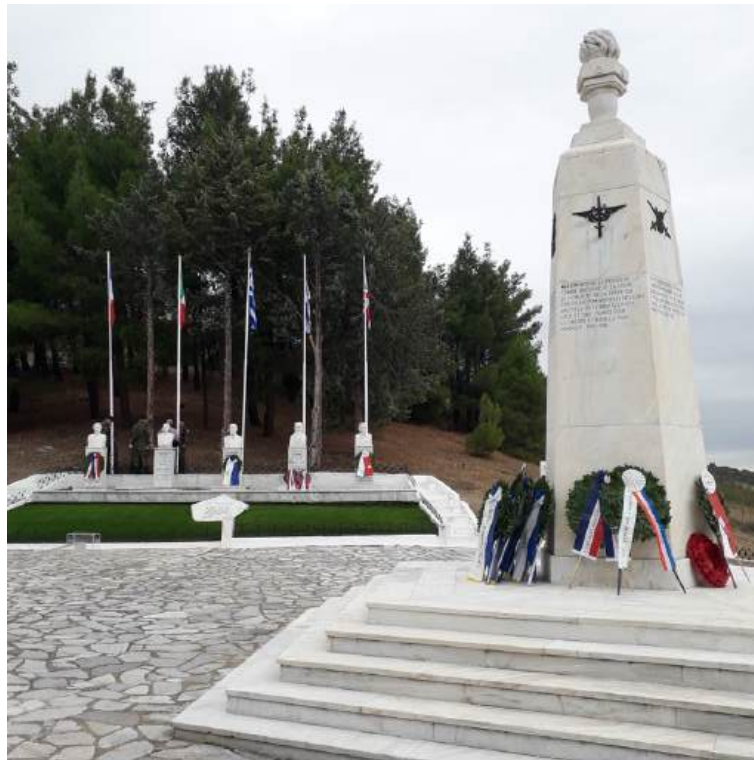
Allied Five Nations Memorial, Polykastro, Greece.

The SCS Battlefield Tour departs every September, and you do not have to be a member to participate. To attend is to follow in the footsteps of the Royal Welsh Fusiliers, South Wales Borderers, and the Welsh Regiment.