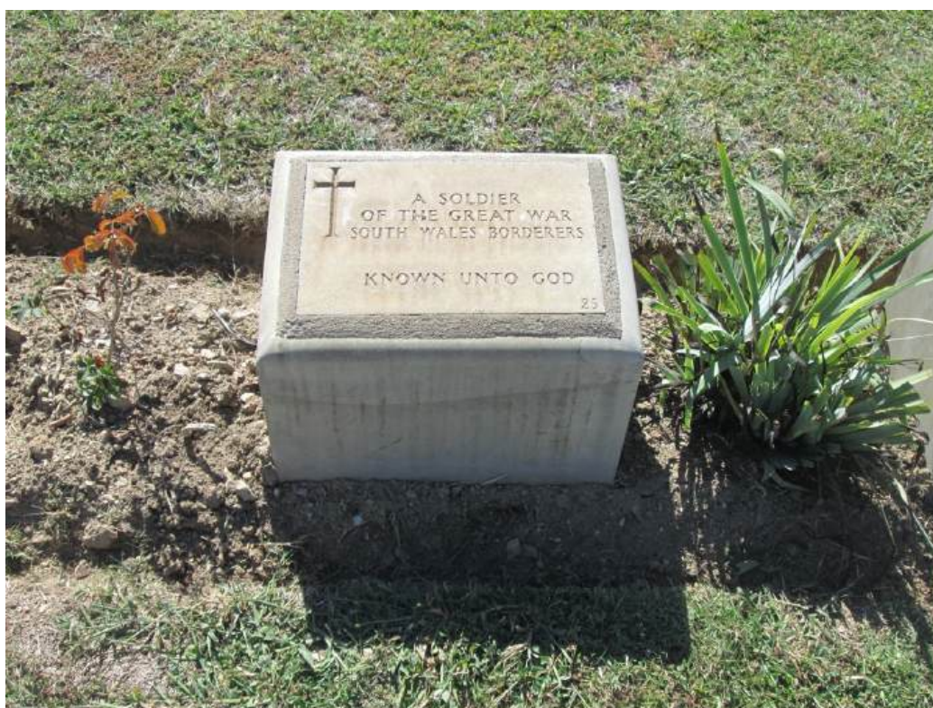
An Unknown South Wales Borderer at the CWGC Doiran Cemetery.